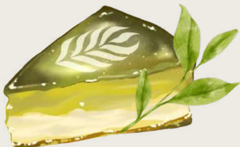
MATCHA JAPANESE 10- CHEESECAKE