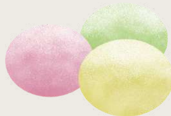
RAINBOW MOCHI 9- Mochi Ice Cream Flavors Strawberry | Mango | Green tea