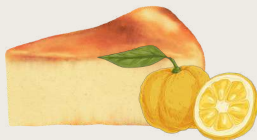
YUZU CHEESECAKE 10-