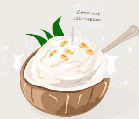
COCO ICE CREAM 9- Classic homemade (GF)