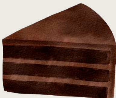
FLOURLESS 12- CHOCOLATE CAKE (GF)